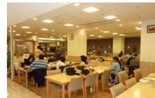
Canteen at Dinner Time