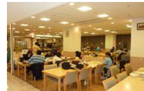
Canteen at Dinner Time