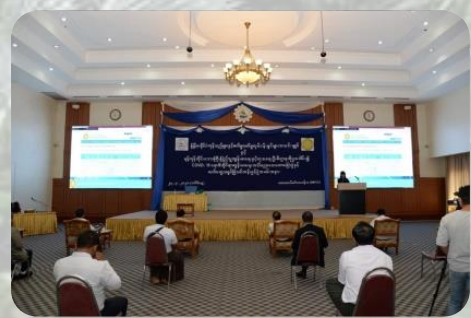
Covid-19 Awareness Program, 2020