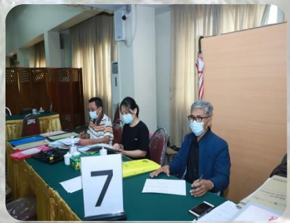
3 rd Covid Loan, 2020