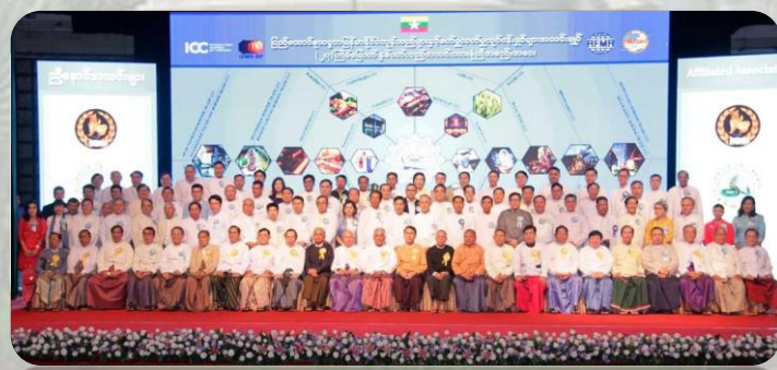
27 th Annual General Meeting, 2018