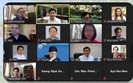
Advocacy Capacity Building Meeting, 2020