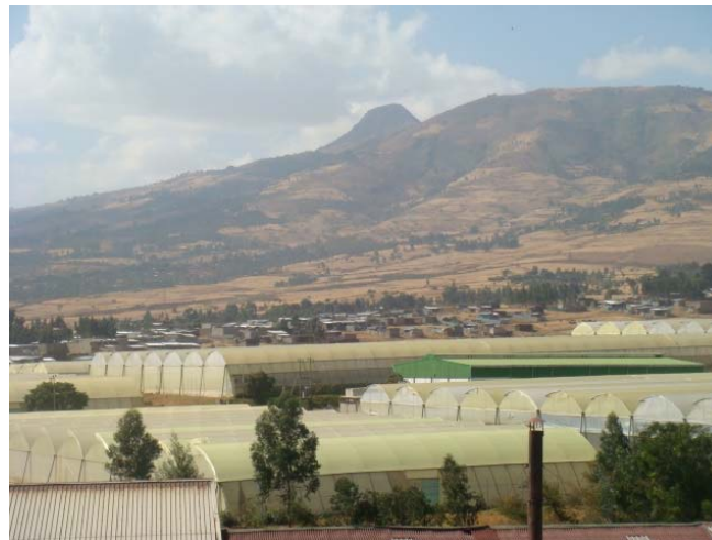
Scenery from a window of the factory