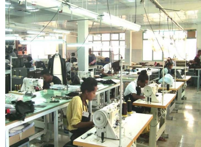
Inside the factory