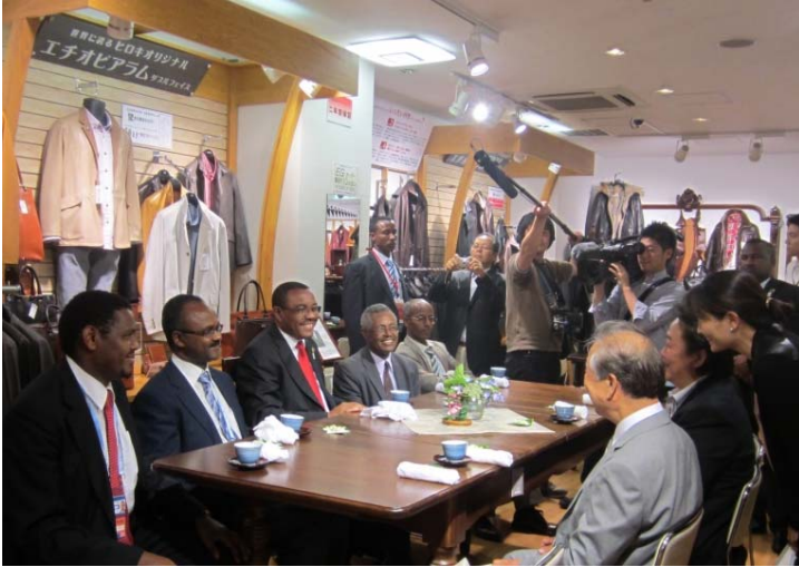
Then-Prime Minister Hailemariam Desalegn and other ministers at Hiroki's head office, June 2013