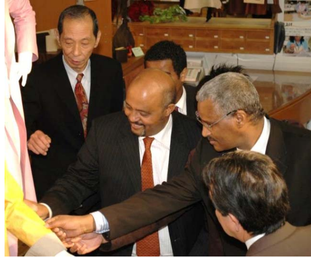
Then-Minister of Trade and Industry Tadesse Haile at Hiroki's head office, March 2009