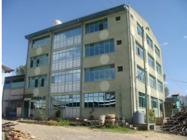
Exterior of the factory