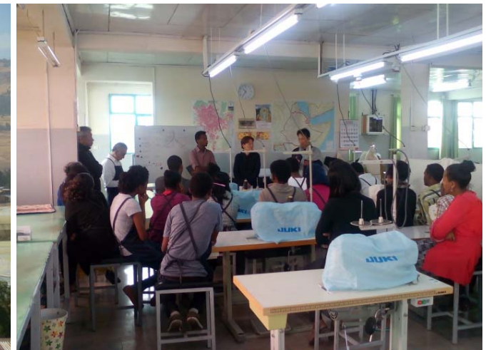
Factory staff meeting